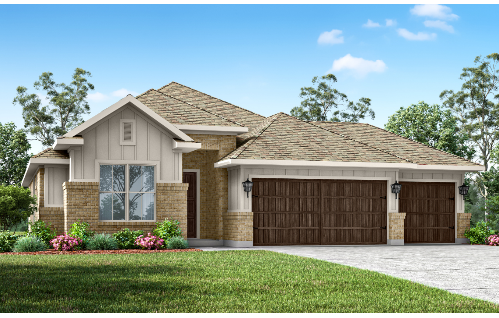
ELEVATION J - 2143 SQ.FT.