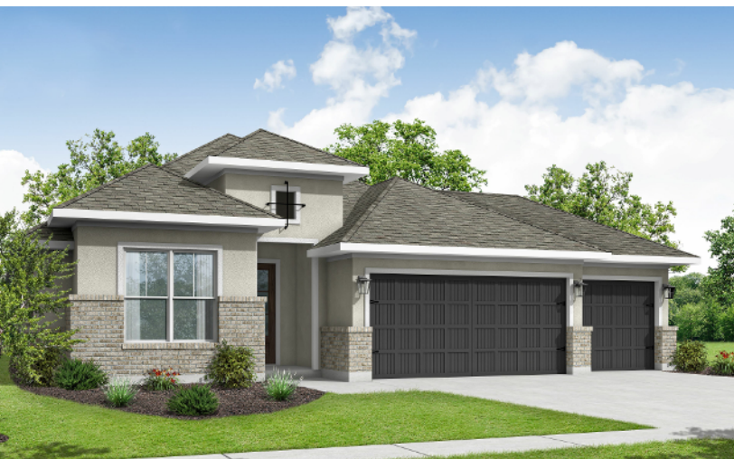
ELEVATION E - 2143 SQ.FT.