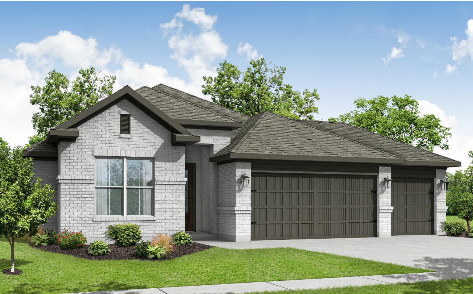
ELEVATION D - 2143 SQ.FT.