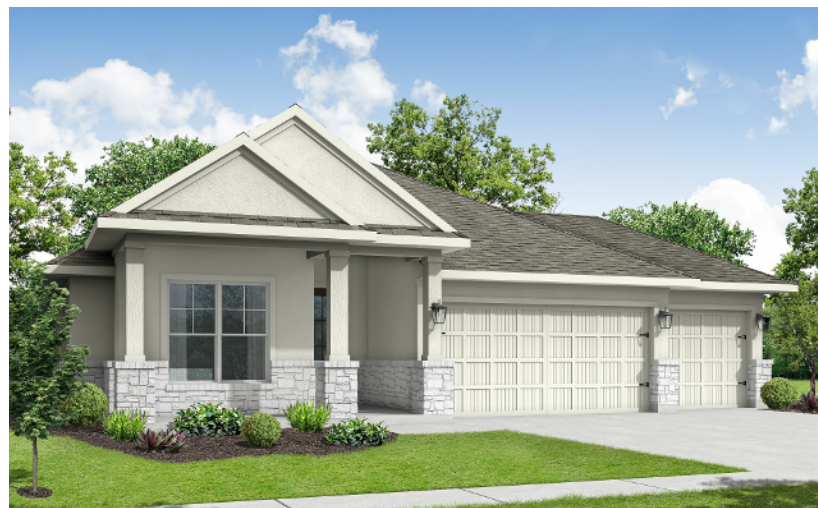
ELEVATION F - 2143 SQ.FT.