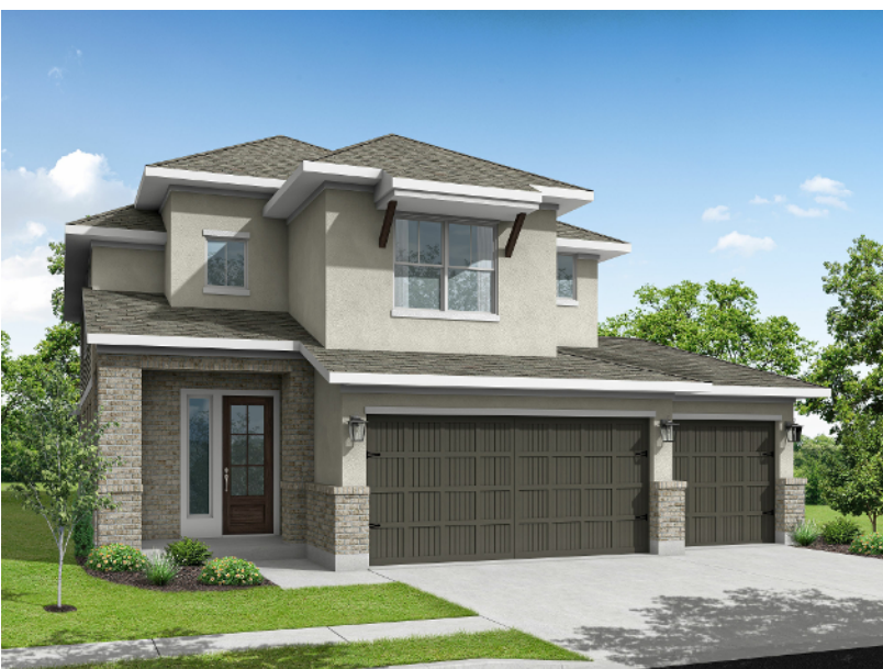
ELEVATION B - 2649 SQ.FT.