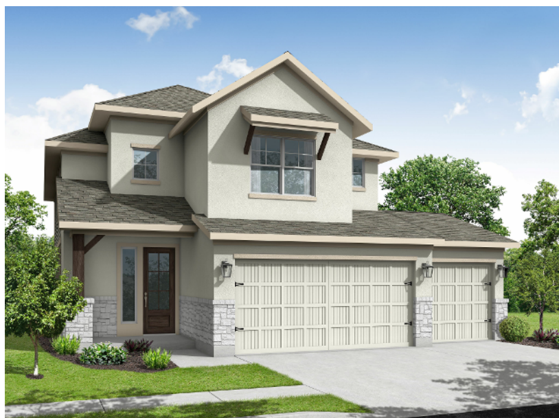
ELEVATION C - 2649 SQ.FT.