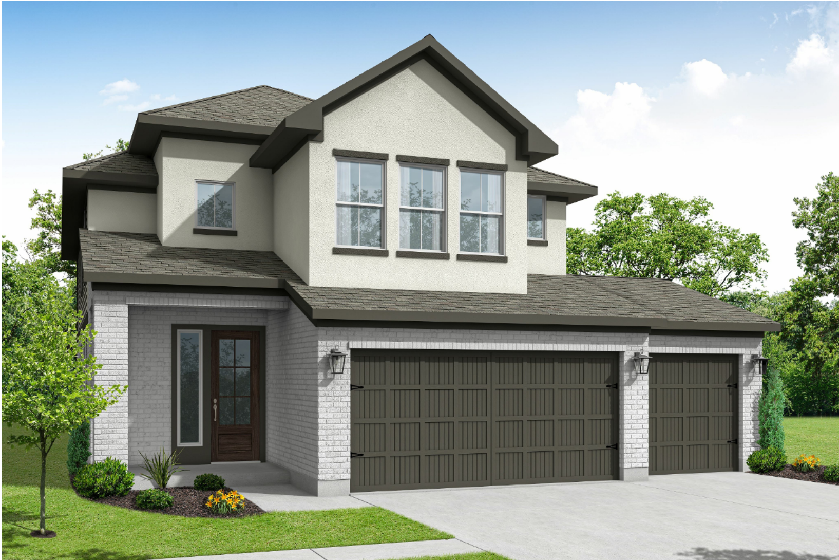
ELEVATION A - 2649 SQ.FT.