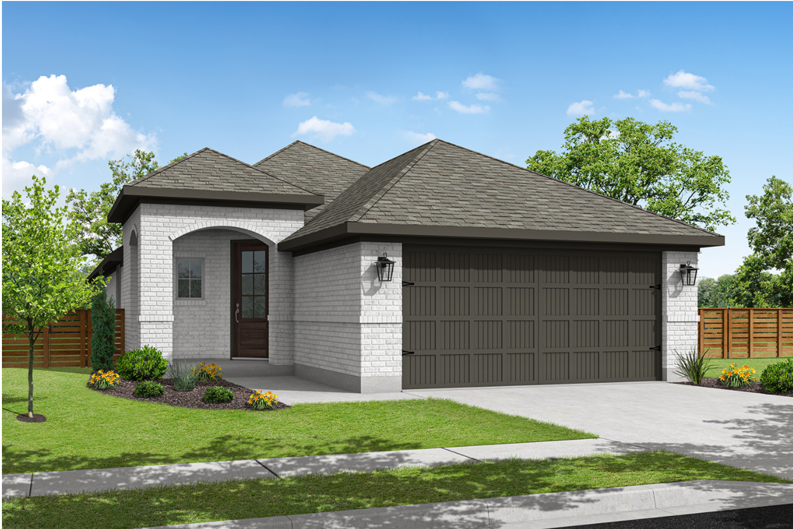
ELEVATION A - 1716 SQ.FT.