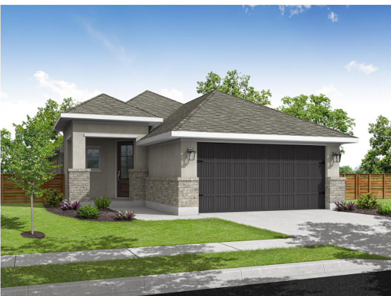
ELEVATION B - 1711 SQ.FT.