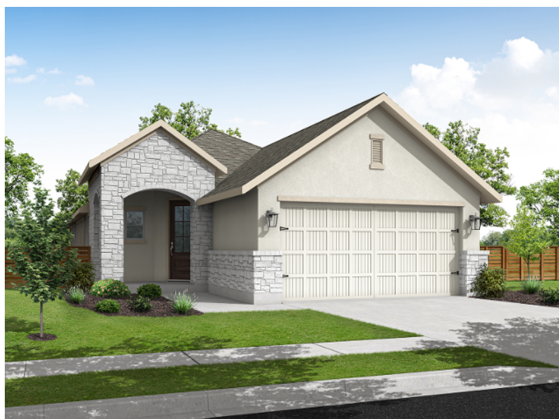
ELEVATION C - 1711 SQ.FT.