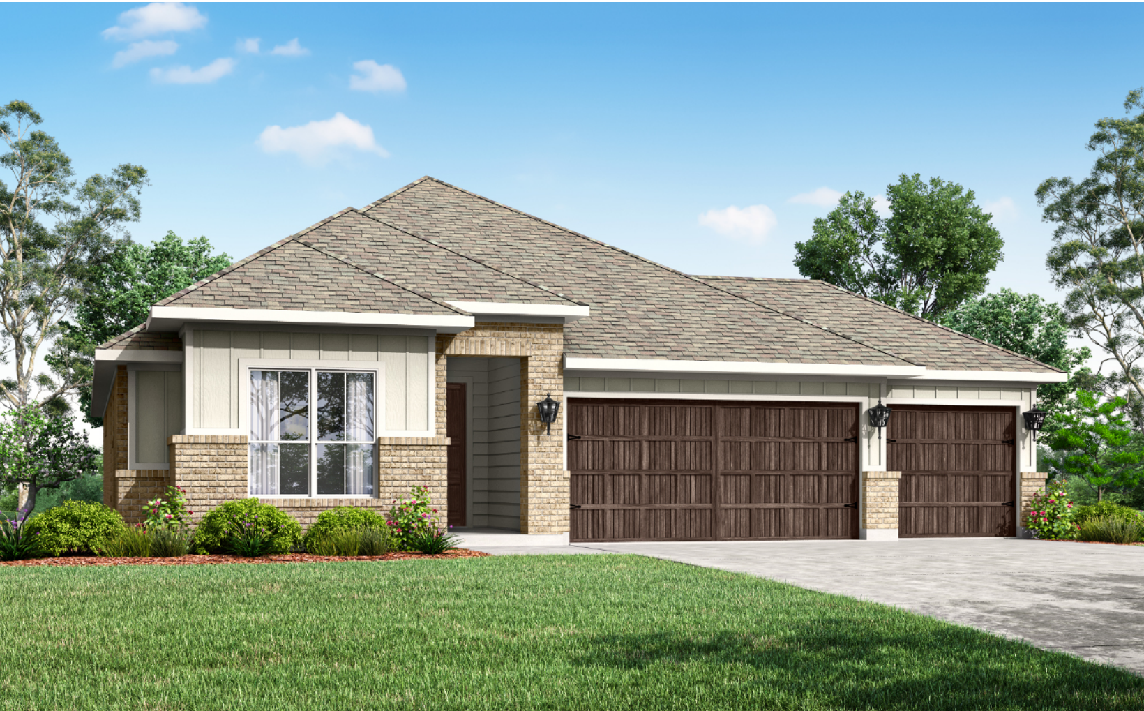
ELEVATION J - 1911 SQ.FT.