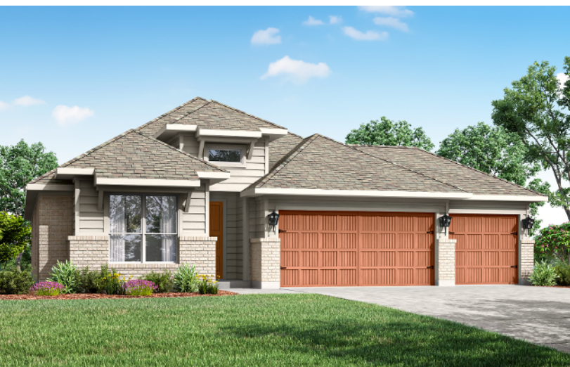
ELEVATION K - 1905 SQ.FT.