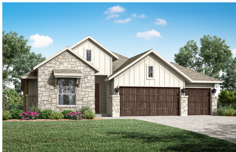
ELEVATION L - 1905 SQ.FT.