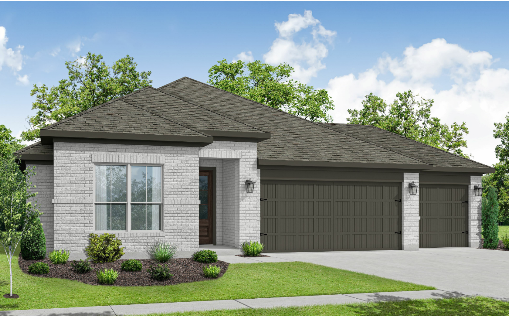
ELEVATION D - 1911 SQ.FT.