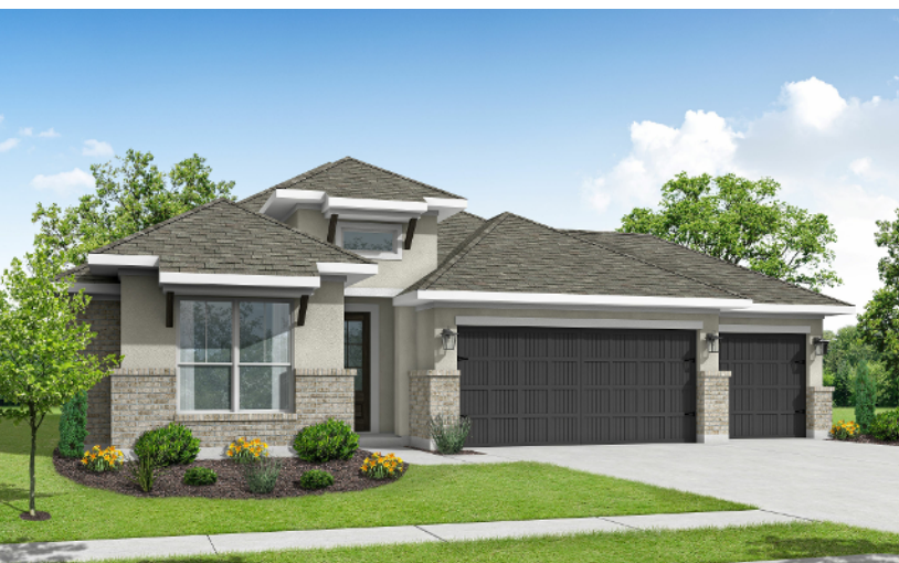
ELEVATION E - 1905 SQ.FT.