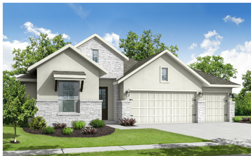
ELEVATION F - 1905 SQ.FT.