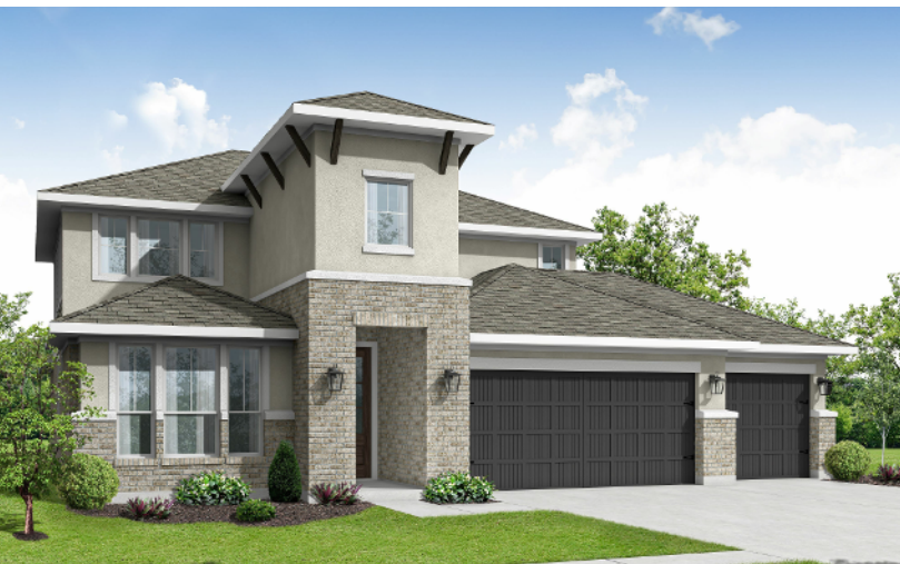
ELEVATION E - 2845 SQ.FT.