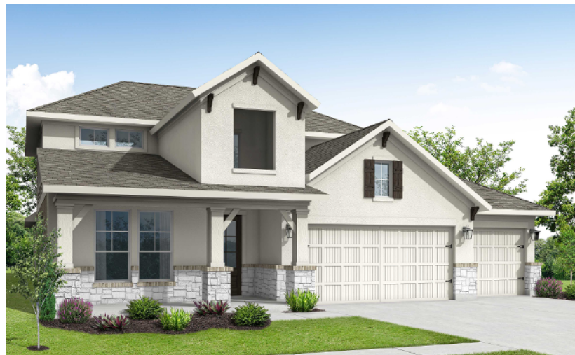
ELEVATION F - 2845 SQ.FT.