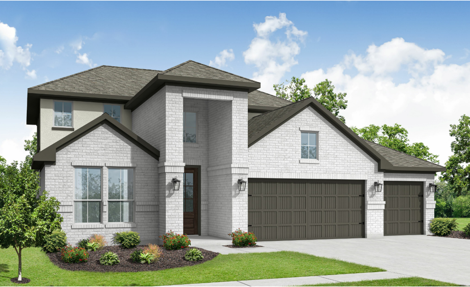
ELEVATION D - 2838 SQ.FT.