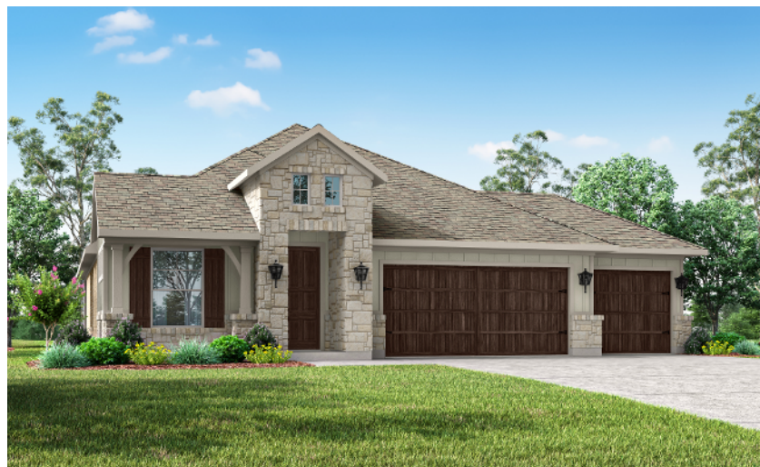
ELEVATION L - 1968 SQ.FT.