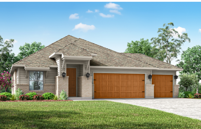
ELEVATION K - 1968 SQ.FT.