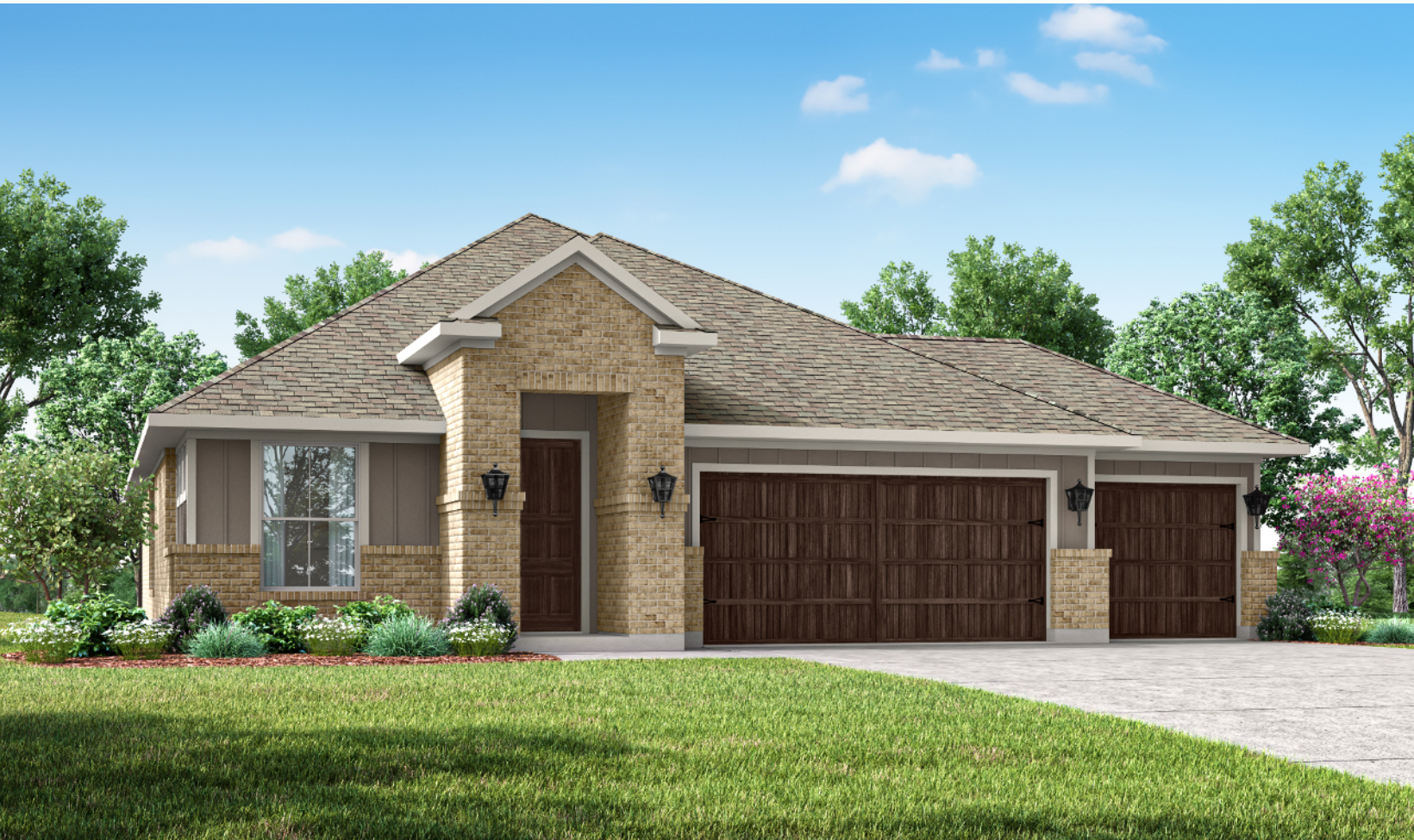
ELEVATION J - 1968 SQ.FT.