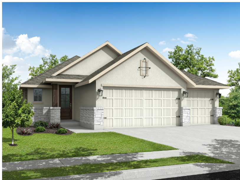
ELEVATION C - 1527 SQ.FT.