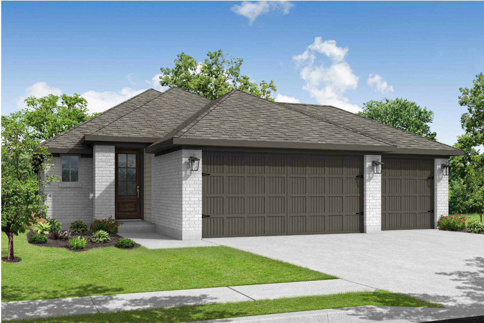
ELEVATION A - 1527 SQ.FT.