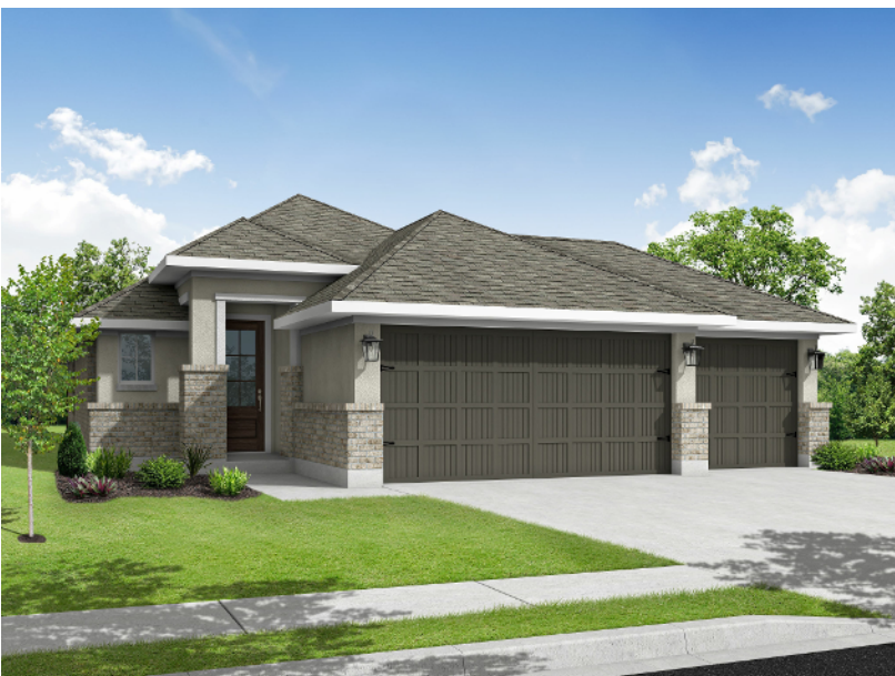
ELEVATION B - 1527 SQ.FT.