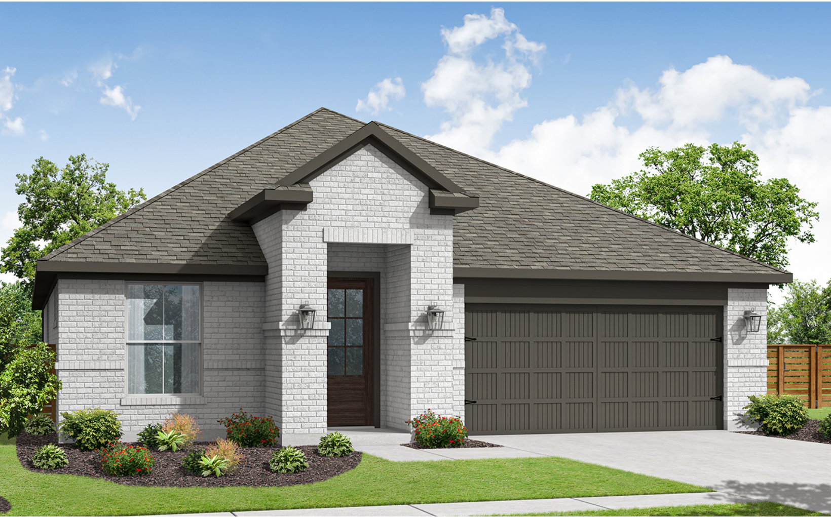
ELEVATION D - 1968 SQ.FT.