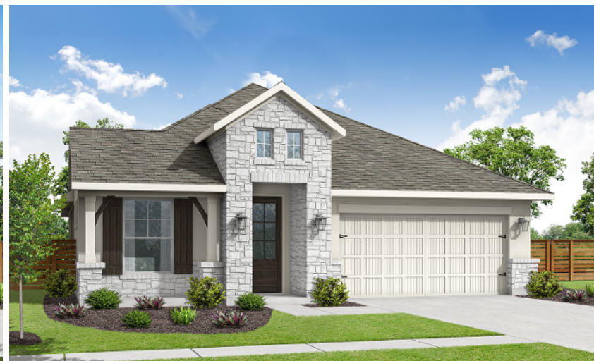
ELEVATION F - 1968 SQ.FT.