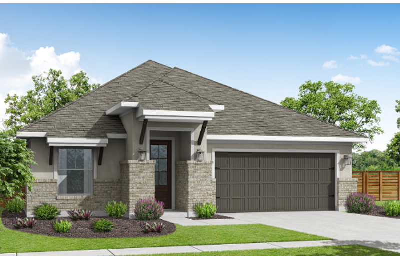
ELEVATION E - 1968 SQ.FT.