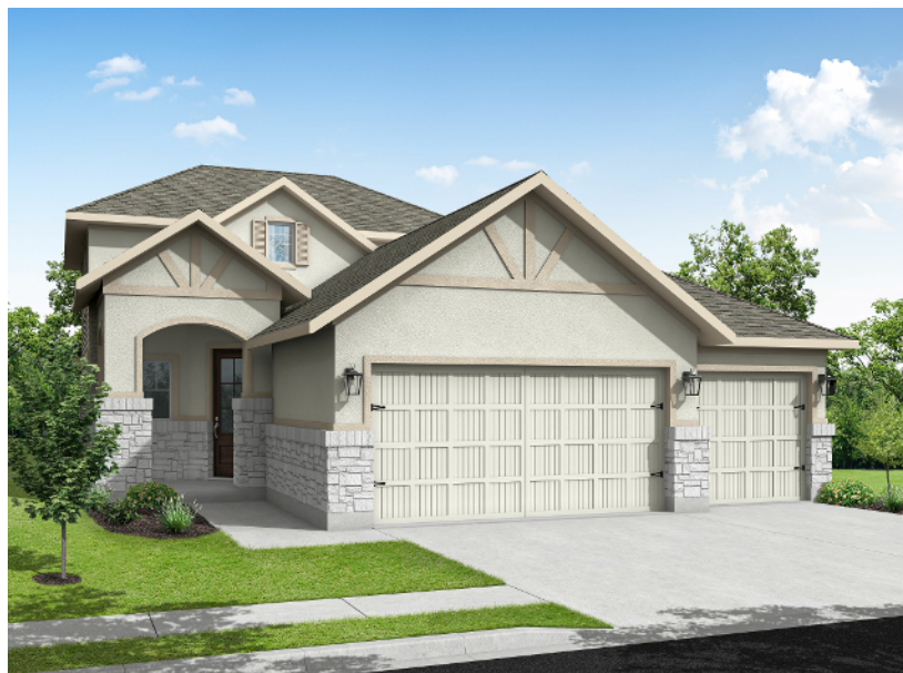
ELEVATION C - 2450 SQ.FT.