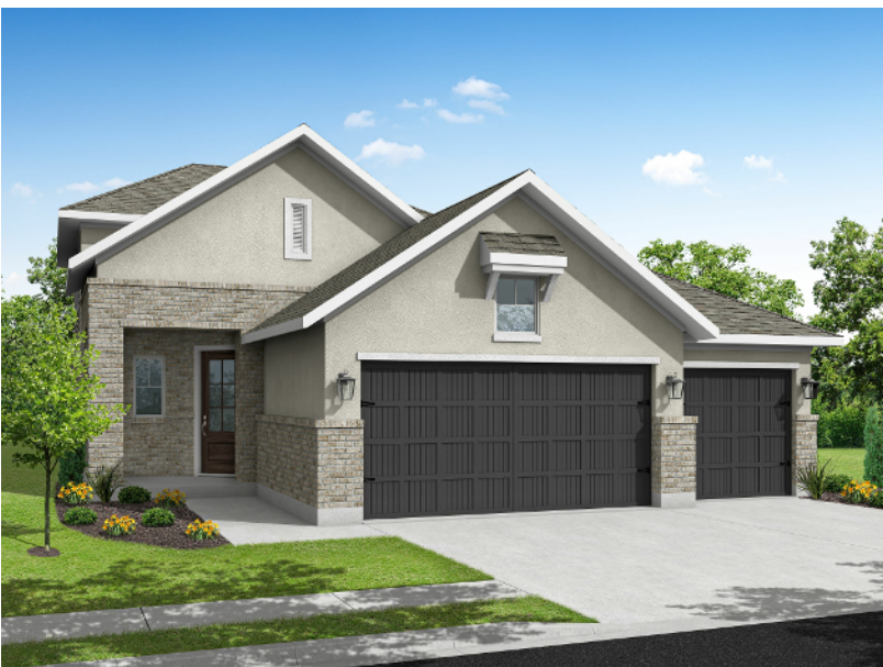
ELEVATION B - 2450 SQ.FT.