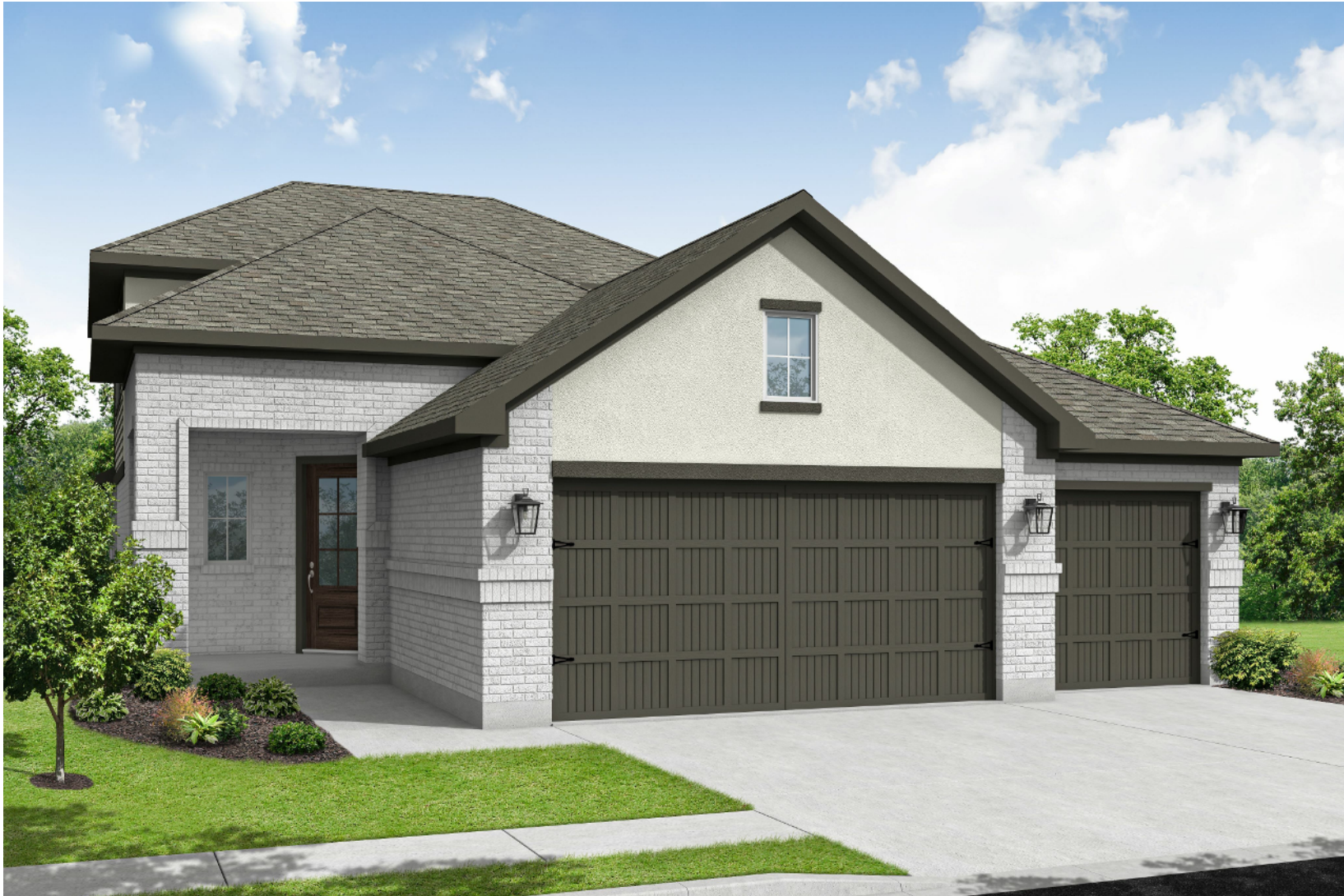
ELEVATION A - 2450 SQ.FT.