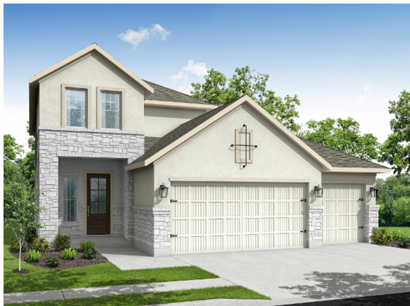
ELEVATION C - 2307 SQ.FT.