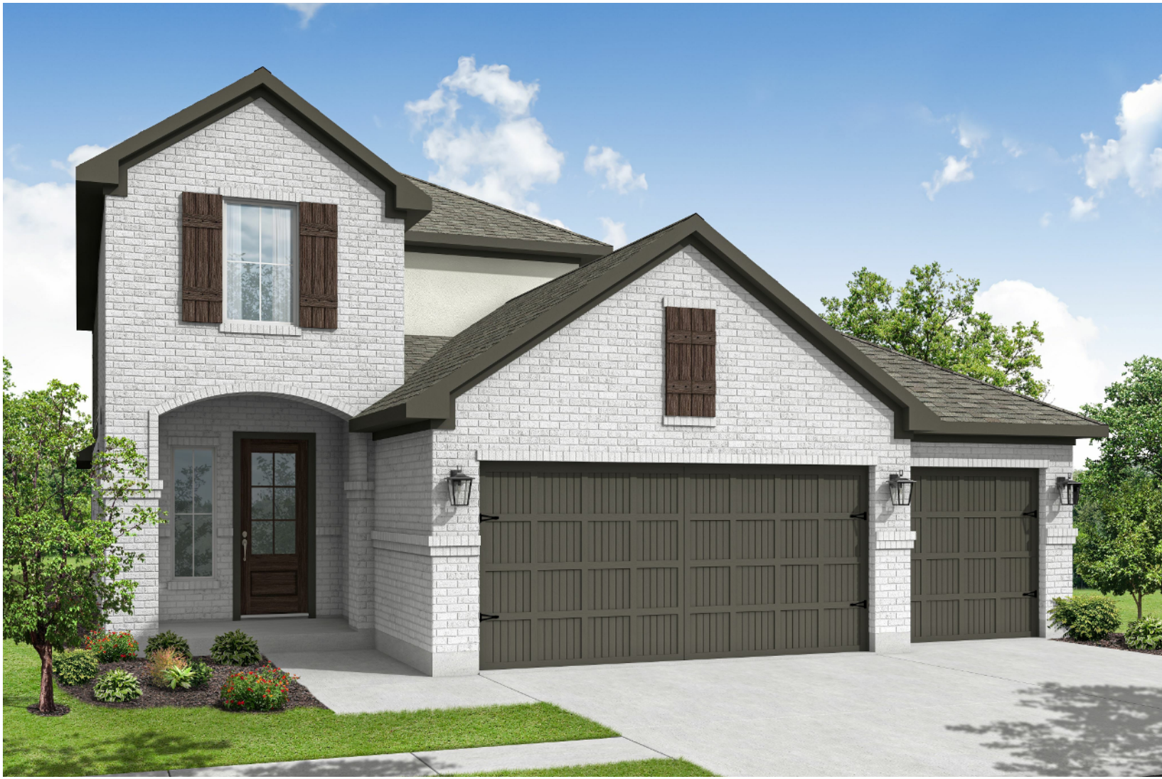
ELEVATION A - 2307 SQ.FT.