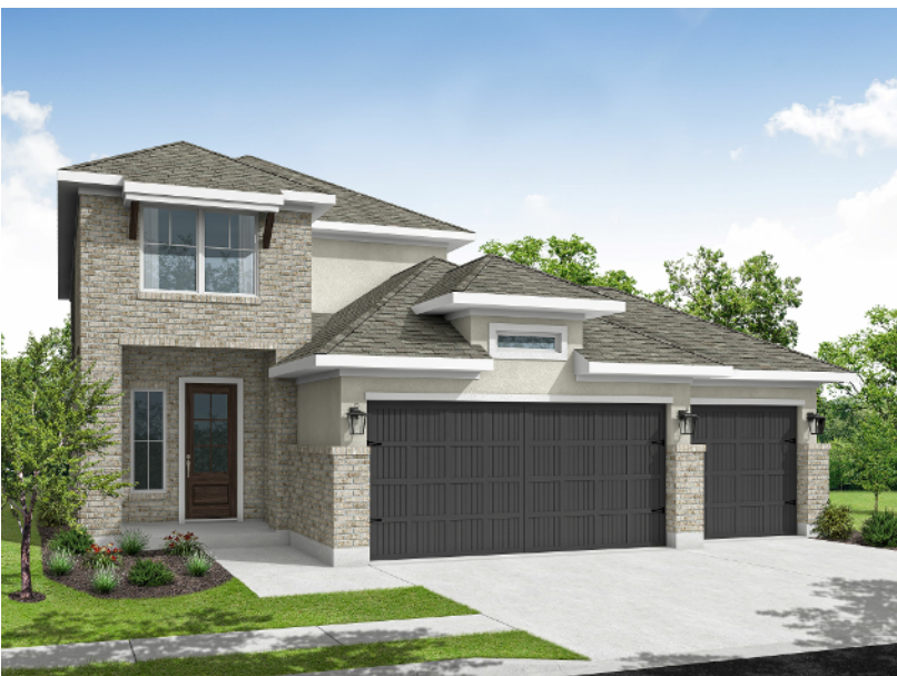
ELEVATION B - 2307 SQ.FT.