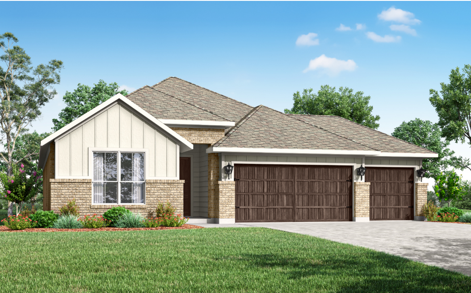
ELEVATION J - 1759 SQ.FT.