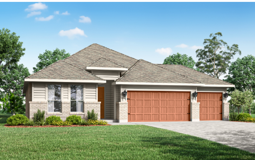
ELEVATION K - 1753 SQ.FT.