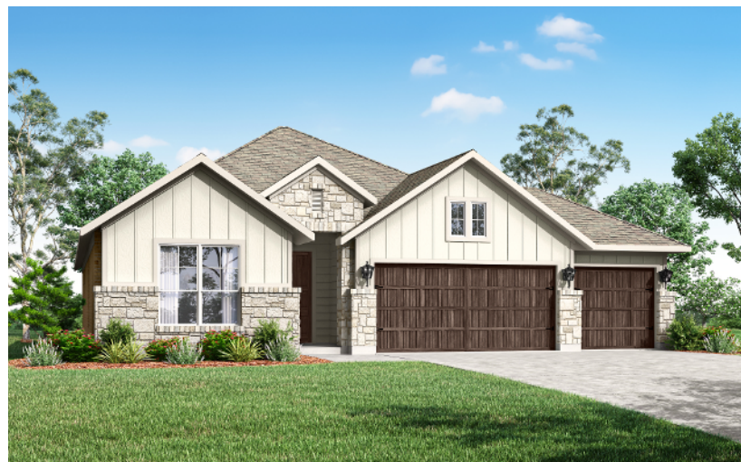
ELEVATION L - 1752 SQ.FT.