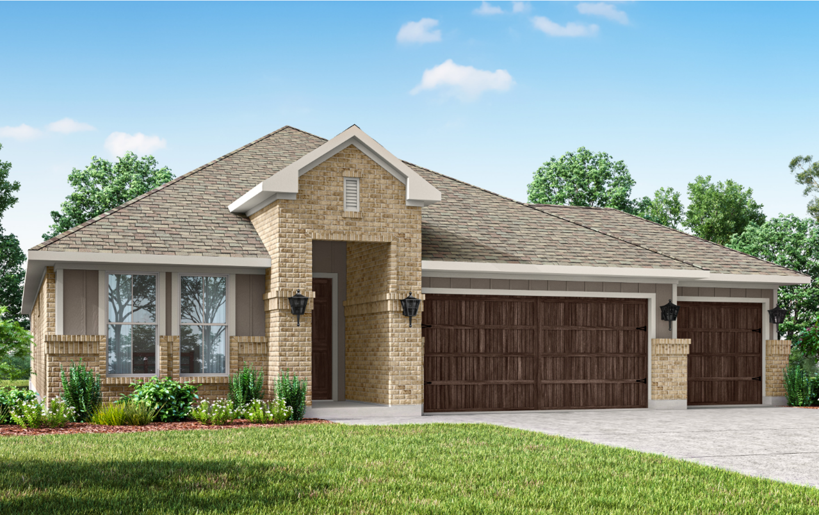
ELEVATION J - 2400 SQ.FT.