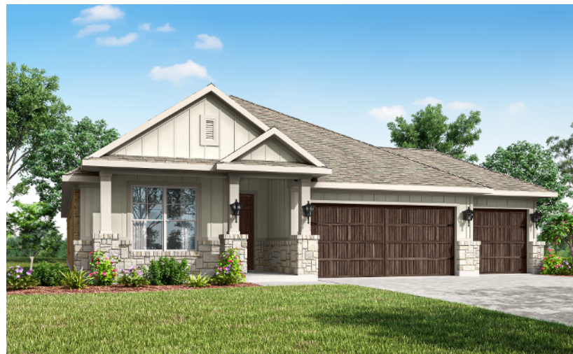
ELEVATION L - 2400 SQ.FT.