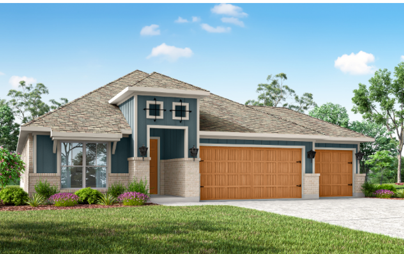
ELEVATION K - 2400 SQ.FT.