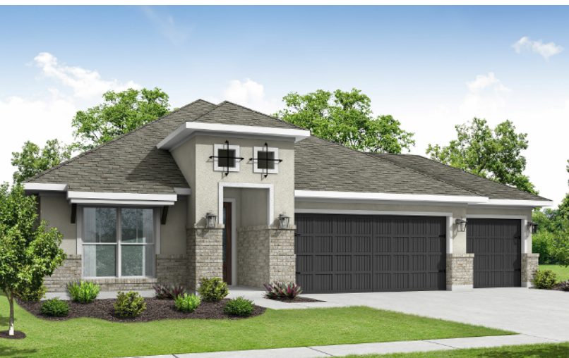
ELEVATION E - 2400 SQ.FT.