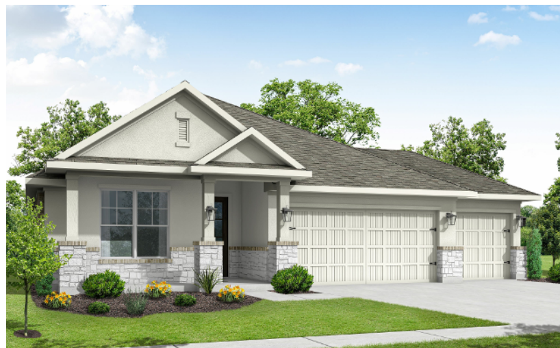
ELEVATION F - 2400 SQ.FT.