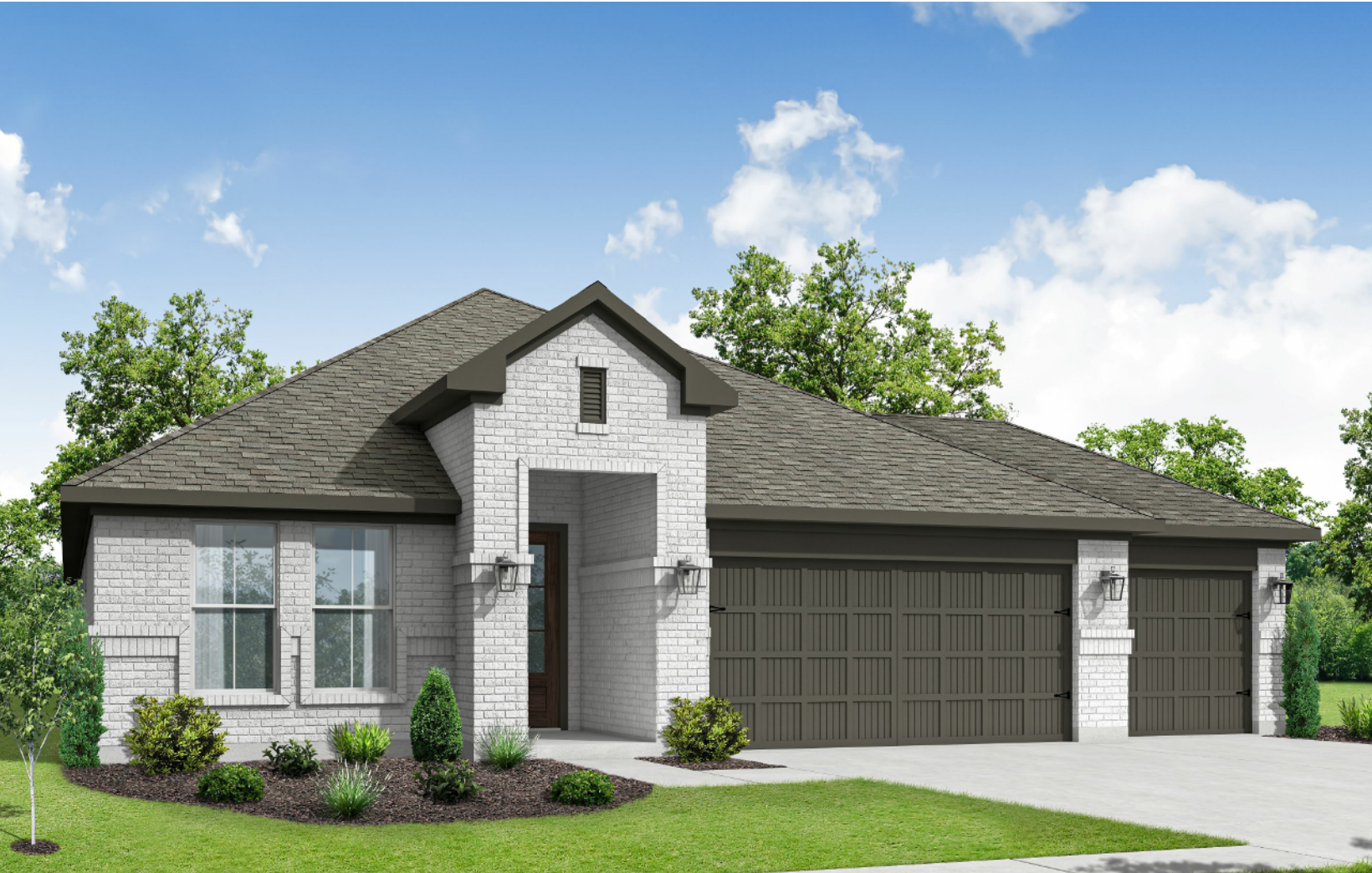
ELEVATION D - 2400 SQ.FT.