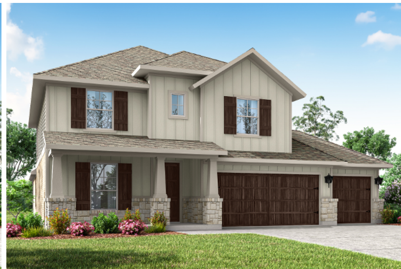
ELEVATION L - 3246 SQ.FT.