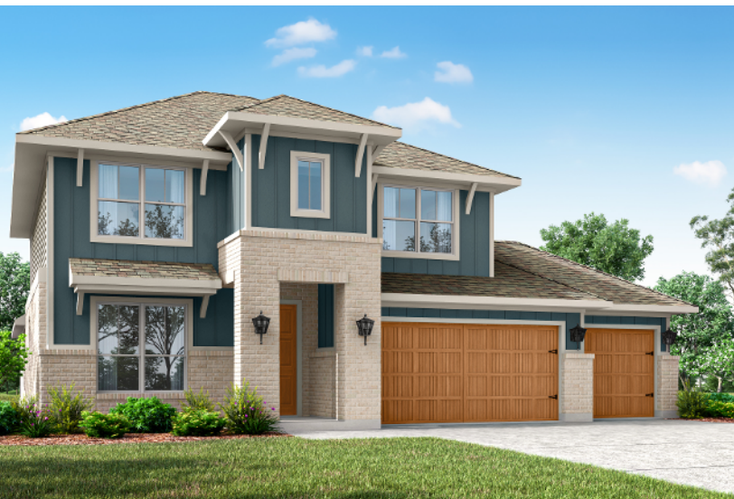
ELEVATION K - 3249 SQ.FT.