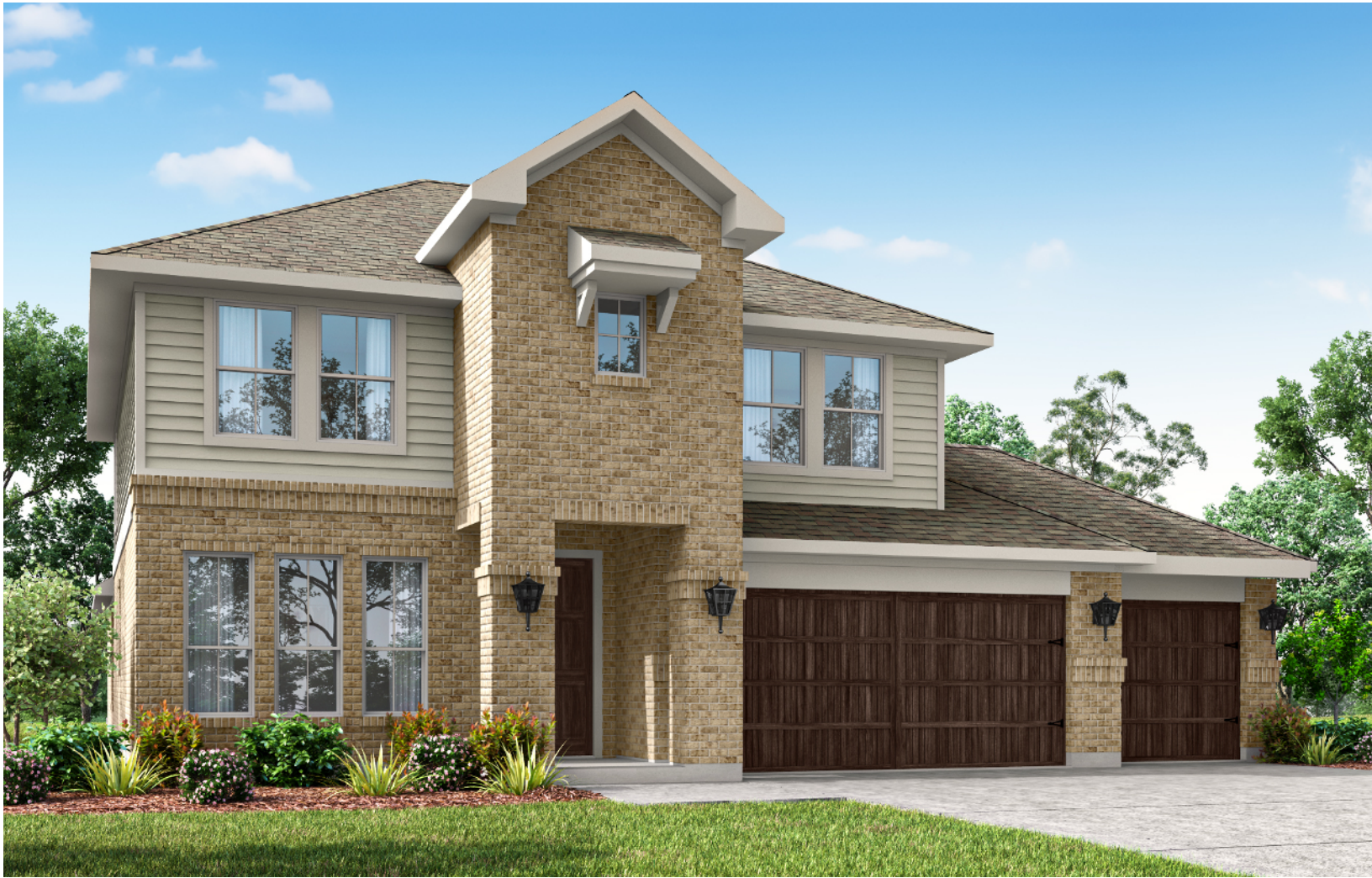
ELEVATION J - 3249 SQ.FT.