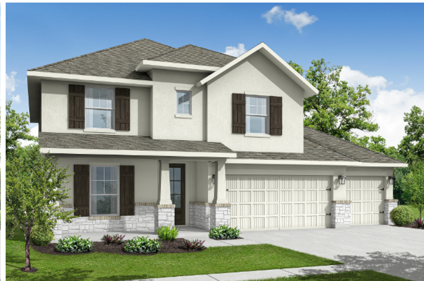
ELEVATION F - 3246 SQ.FT.