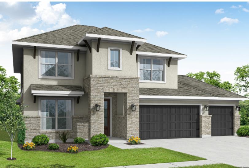
ELEVATION E - 3249 SQ.FT.