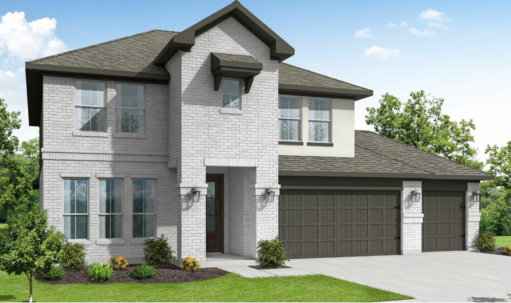
ELEVATION D - 3249 SQ.FT.